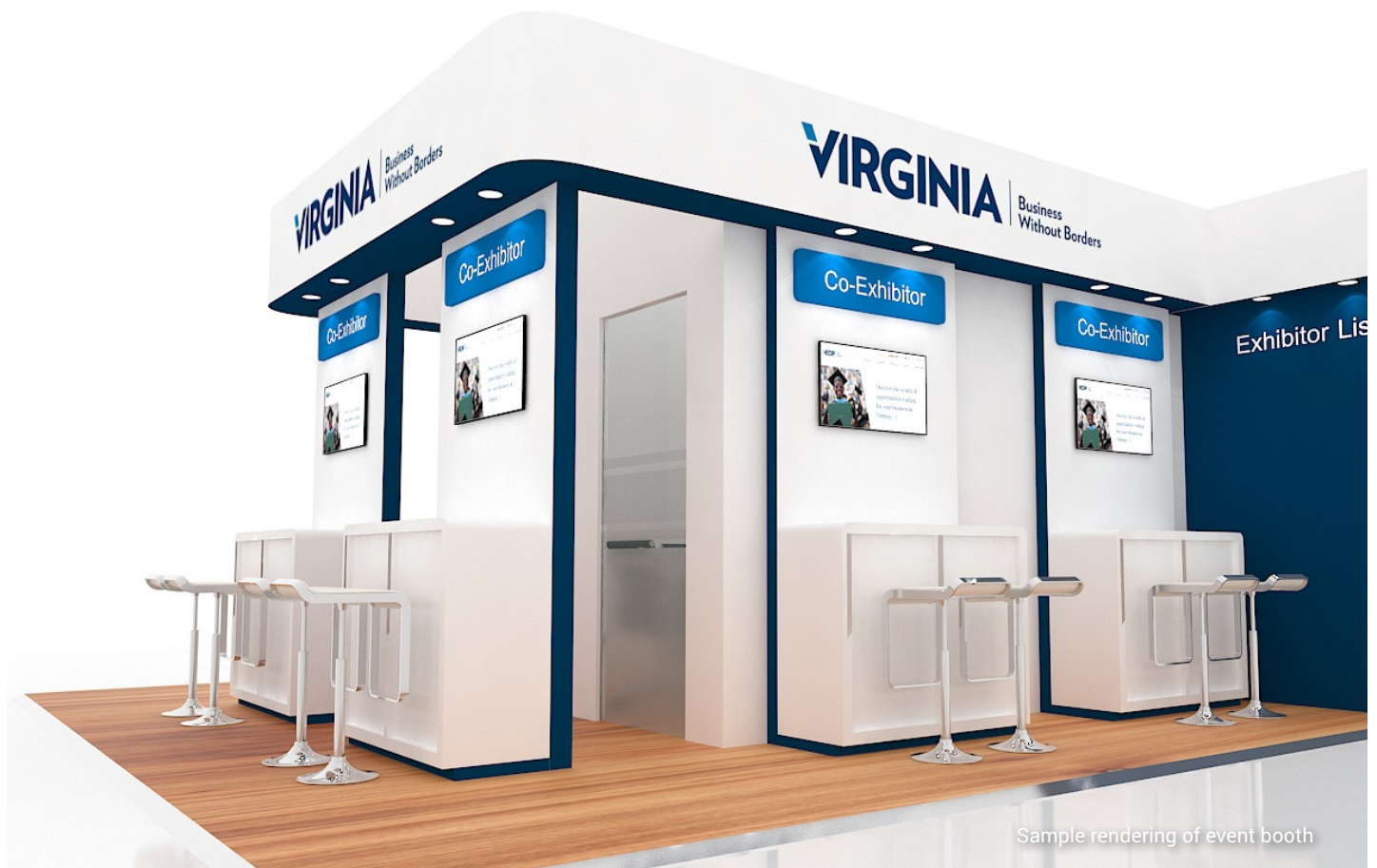
Sample rendering of event booth