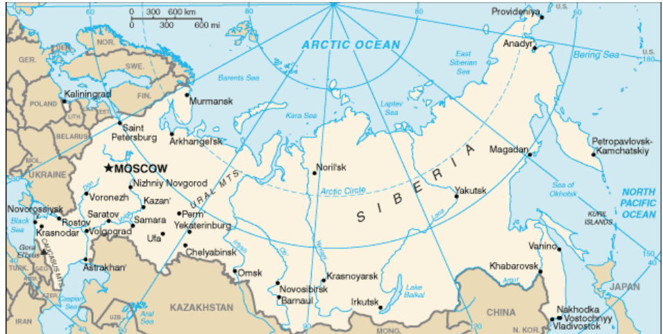
(Russia Map. CIA)