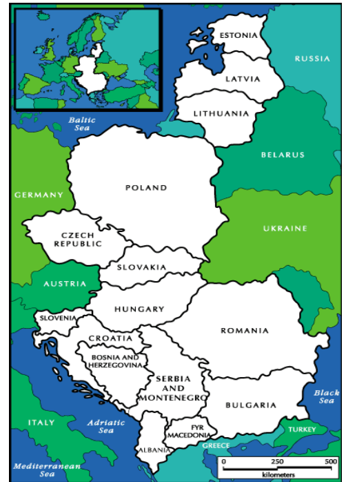
(Eastern Europe Map. The Regional Environmental Center for Central and Eastern Europe: Szentendre: Hungary, 2004)