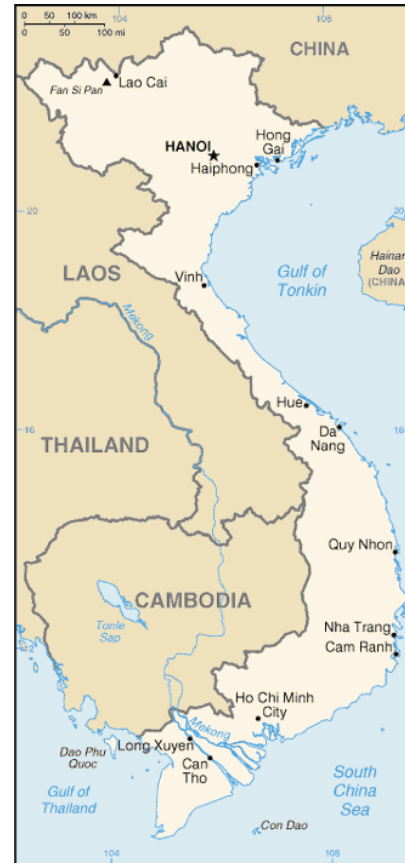
(Map of Vietnam. CIA)