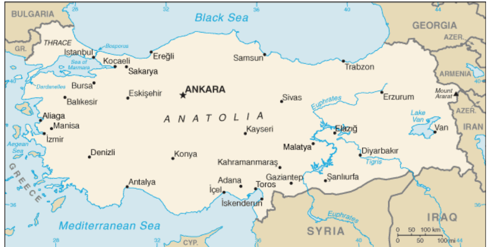
(Turkey Map. CIA)