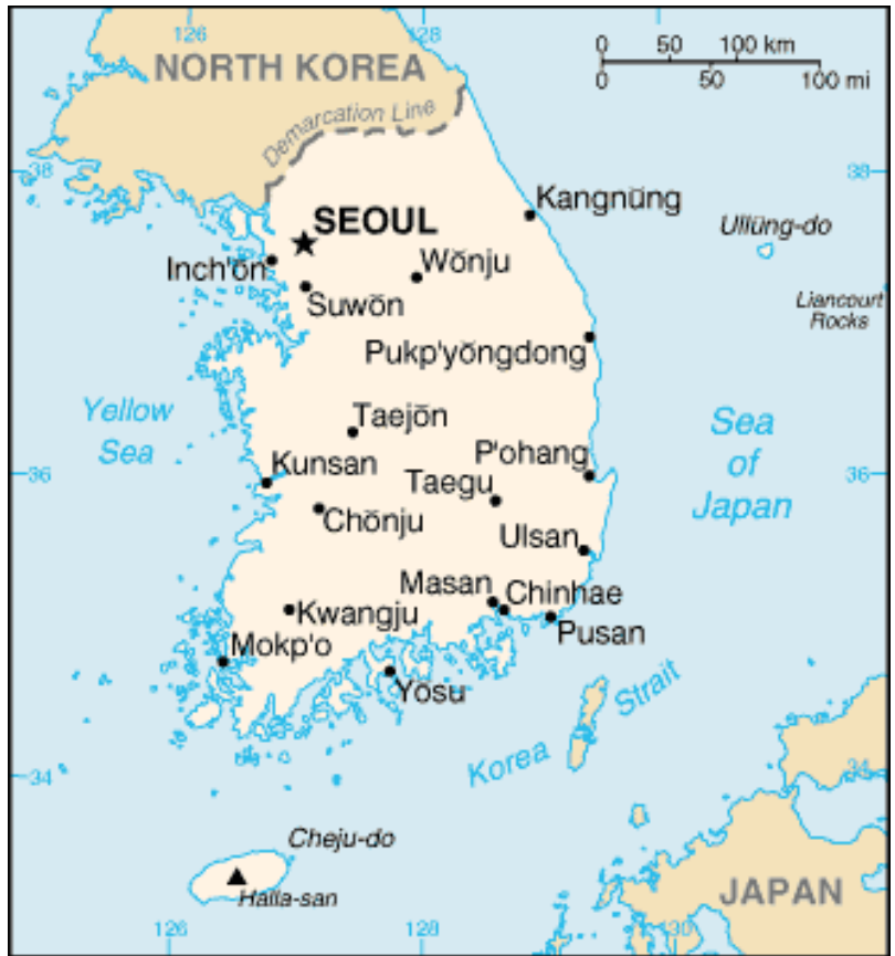
(South Korea Map. University of Texas-Austin)