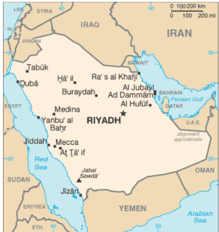
(Saudi Arabia Map. CIA)