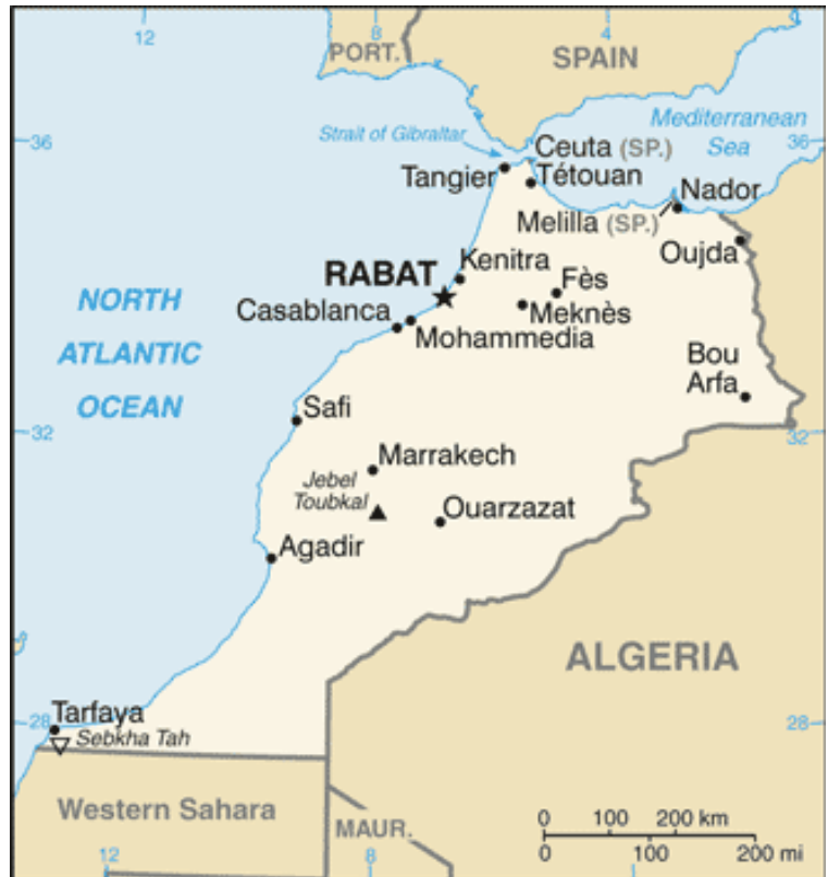
(Morocco Map. CIA)

Moroccan Dirham (MAD) 1US$ = 8.39 MAD (April 2009)