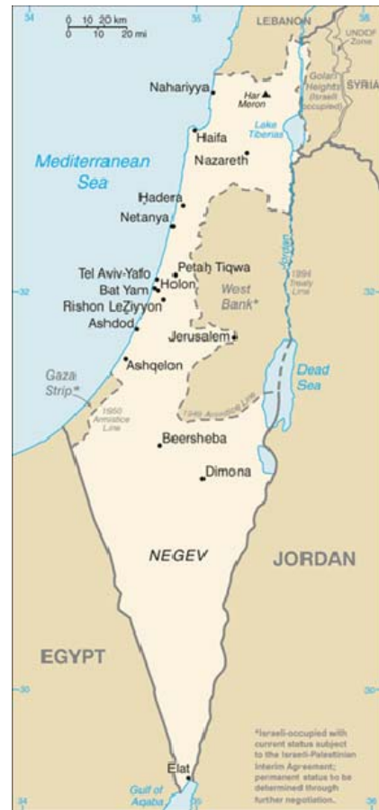
(Israel Map. CIA)

Currency: ( www.oanda.com ) Israeli New Shekel (ILS) 1US$ = 4.21 ILS (April 2009)