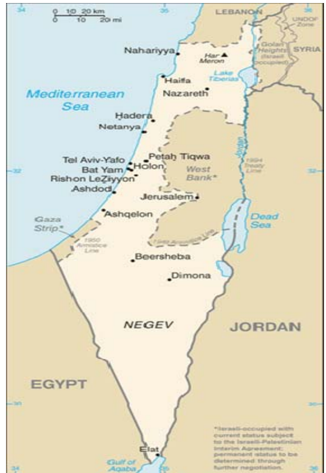
(Israel Map. CIA)