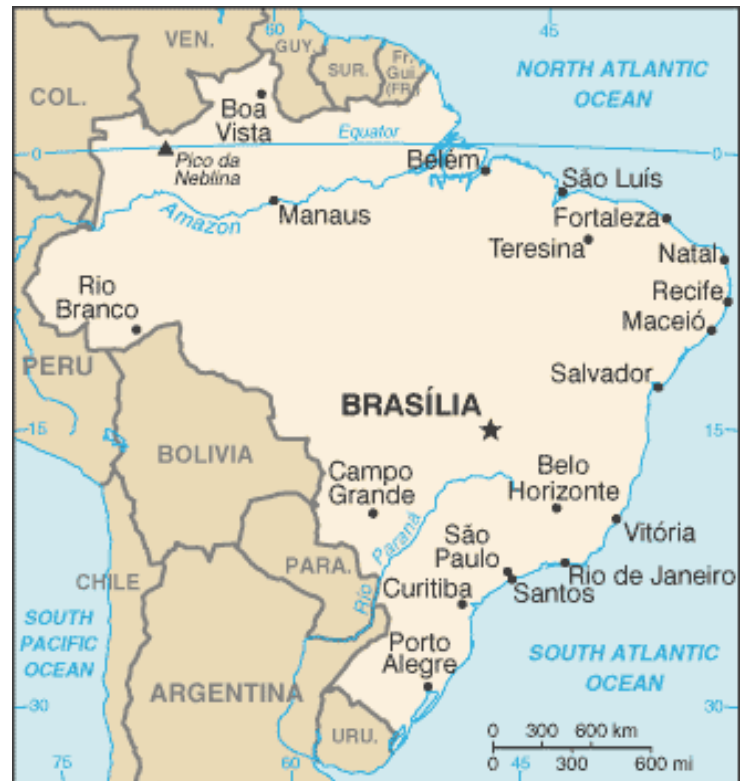
(Brazil Map. CIA)

Currency: Brazilian Real (BRL) 1 US$ = 1.86 BRL (June 2010) ( www.oanda.com )