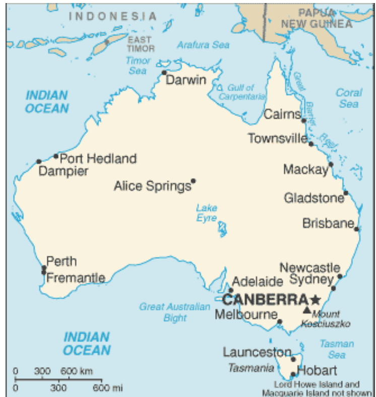
(Australia Map. CIA)